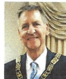
Triennial Other Assembly Committee

Personal Aide to Right Worthy Grand Sentinel